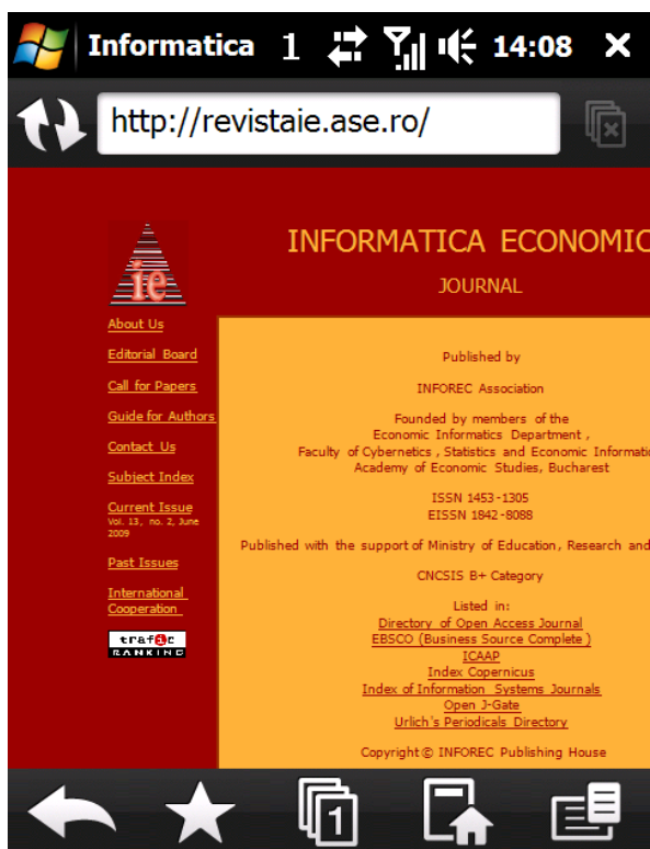
Fig. 1 Opera Mobile Browser on a Windows Mobile Device

Opera Mobile is a platform dependent browser and has at least the same capabilities as Opera Mini.