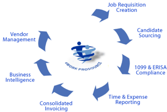
Fig. 2. ProSource chain

e-Selection is a paperless process where electronic documents and information can be quickly disseminated nationwide or worldwide. The most important methods for e-recruitment are: